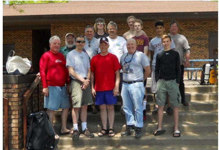
2016 Group photo after diving

2016 beach cleanup report – This was BSA Venture Crew 820's sixth annual Phalen Lake Spring Cleaning occurred on a beautiful sunny 80-degree day. The water was a warm 63 degrees at 23 feet below the surface as pairs of divers covered their assigned zones in depths from 4 feet to 23 feet deep. Nine divers from BSA Scuba Venture Crew 820 teamed up for the under water cleanup and had additional help from two scouts wading through shallow water picking up debris and broken glass left behind after the ice melt. We had an additional 2 parents that served as shore support. Three of the Venture Crew divers are also Great Lakes Shipwreck Preservation Society (GLSPS) members.