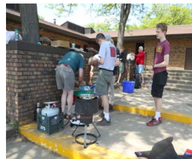
No hot chocolate needed this year, just hot dogs, chips, and juice.