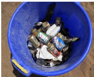
Some of the debris found on the lake bottom

The majority of debris was found in the shallow water and out in the 20 foot depth. The visibility was better than last year at 8 to 10 feet. The divers found a lot of broken glass in the shallow water, aluminum and tin pop cans found in the deeper water. The divers also assisted the City of St. Paul by locating the mooring anchors and chains that hold the 16 by 24 foot floating swim platform. We roped the chains that are attached to the mooring anchors to large floats on the surface, so the cities life guards can finish connecting them to the swim raft in June.